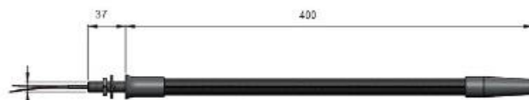
Light Dimensions in mm